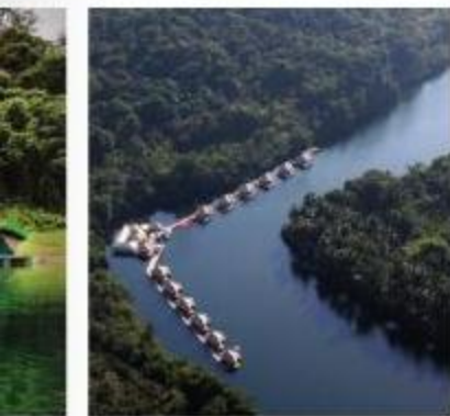
Four rivers Floating Lodge is set in unspoilt Cambodian forest

fragrant frangipani flowers, as well as Javan rhinoceroses, Indochinese tigers and Asian elephants. From the lodge you can also swim, kayak and take a trip to the nearby Tatoi waterfall. Each tent has a minibar, Wi-Fi, flatscreen TV, top-quality furnishings and a private balcony. Double villas start at £71.61 per night, including taxes, booked through AsiaRooms.