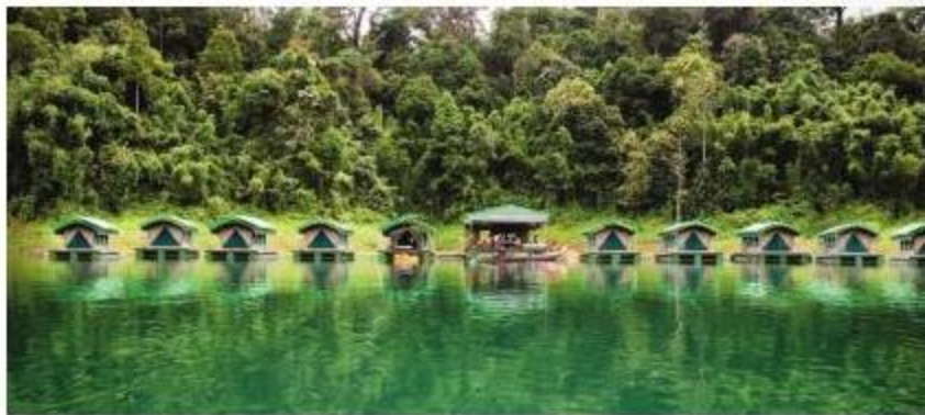
Elephant Hills is a luxury camp in a Thai national park - this year 10 floating tents were added to the camp's accommodation portfolio

Elephant Hills is a well-established luxury camp in Khao Sok national park in southern Thailand. The original camp has 30 tents set in the jungle, and earlier this year 10 floating tents were added at nearby Cheow Larn Lake, complete with crisp, white sheets, en-suite bathrooms and wooden, safari-style furniture. Activities on offer include jungle trekking, elephant feeding, night safaris and canoe jaunts (each tent has its own canoe