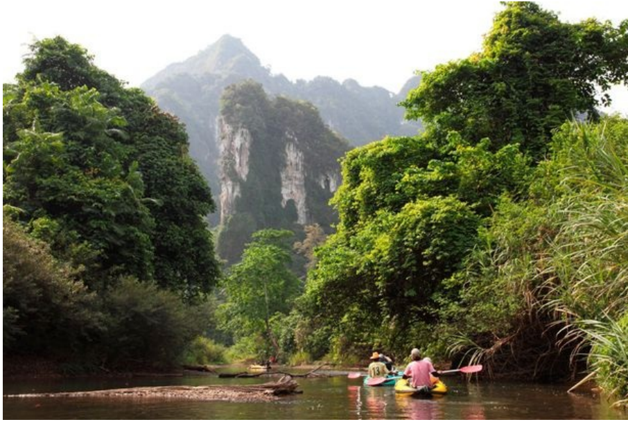
Special: Kayakers paddling on Klong Sok River

After all that activity, it was time to relax – and the glorious beaches of Khao Lak, swept by the azure Andaman Sea, was the perfect place.