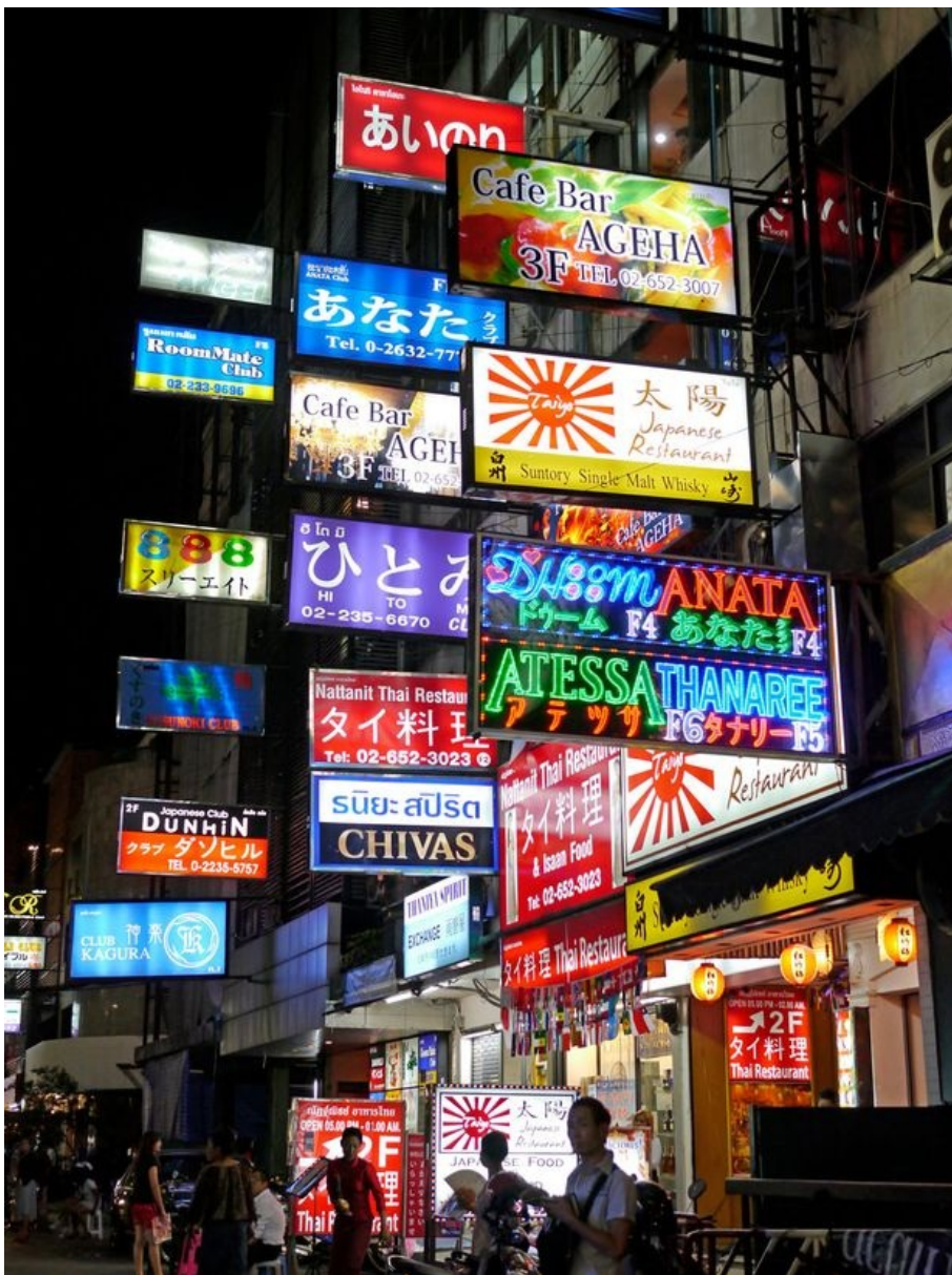
Buzzing: Signs in the Patpong area at night

In the morning we left for Cheow Larn Lake, which covers 103 square miles in the centre of the park, to stay at the Rainforest Camp.