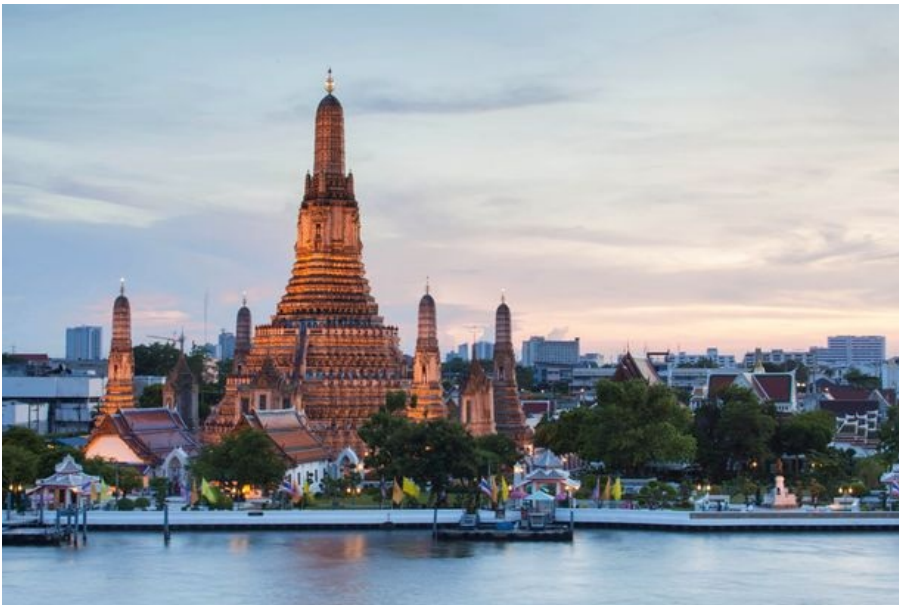
Imposing: The Temple of Dawn

This huge complex is a multi-floor mix of market and designer shops, selling real and fake goods.